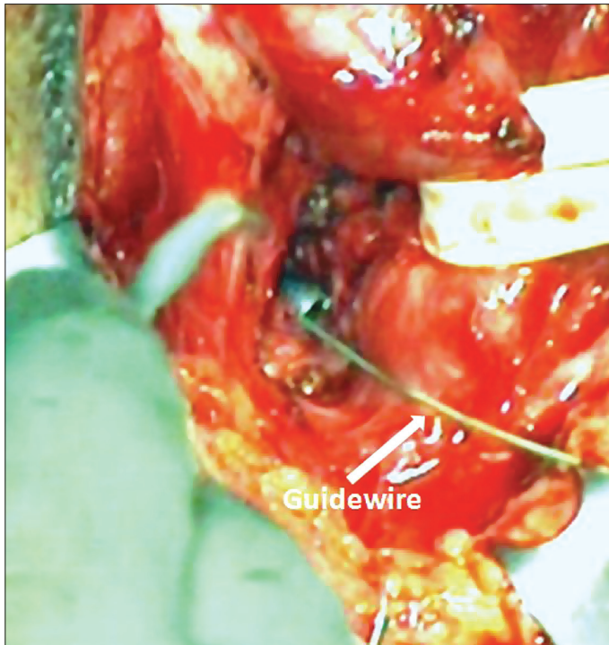
Figure 1. View of a guide wire passed in an antegrade manner through a cystoscope and pulled out from the perineal side